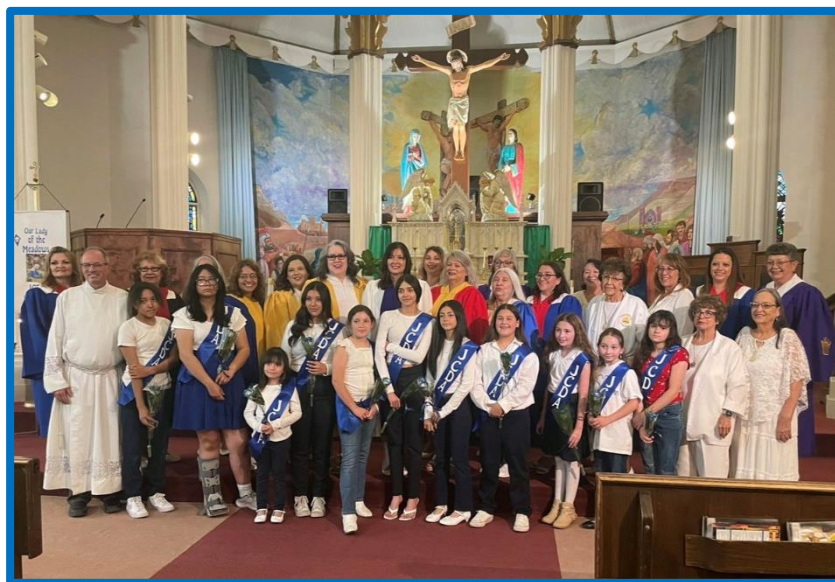
Our Lady of the Meadows #1301 institution in Las Vegas.