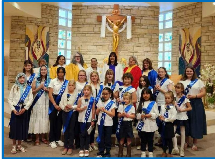
Our Lady of the Morning Star #2594 institution in Los Lunas.

The question about having a JCDA court isn't, "Why?" but, "Why not?!"