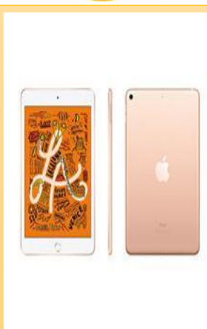
Basket #3 - I-Pad Mini with Wi-Fi 64 GB in Gold

Please return raffles and money by March 15, 2021 to Melinda Gonzales, State Convention Treasurer, PO Box 1833, Las Vegas, NM 87701. Cellphone: 505-228-2138.