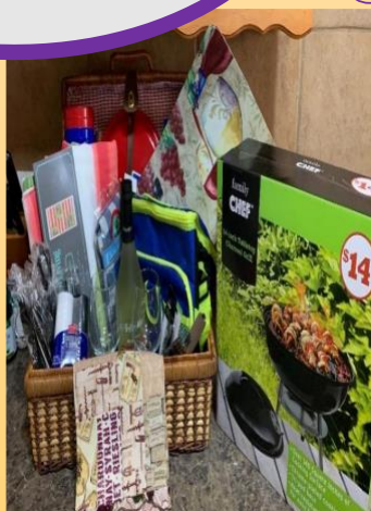
Basket #4 -

Wine & Grill Basket Plates, Cups, Forks, Spoons Corkscrew, Serving Tray Placemats, Salt & Pepper Shakers Bottle of Wine, 2 Wine glasses Wine mat, Table Cover Ice Chest, Beach Towel Small Charcoal Grill