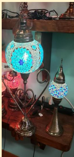
Basket # 1 Turkish Lanterns Designed and Made in Turkey